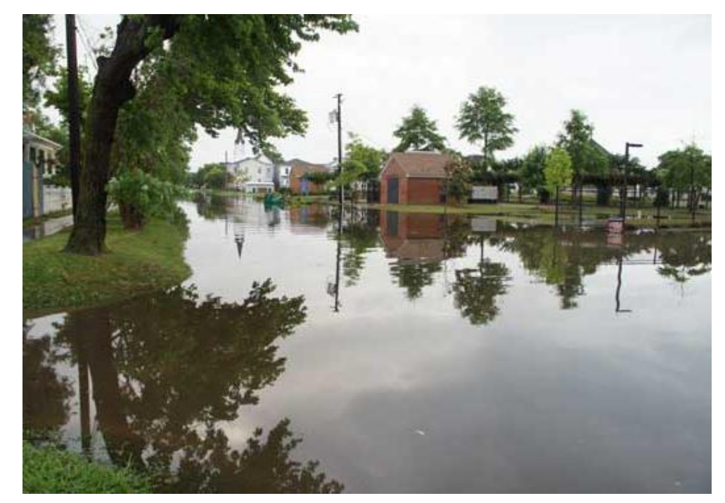
Cape Charles, June 2017

To help Virginia's coastal localities improve resilience to flooding and other coastal storm hazards while remaining economically and socially viable.